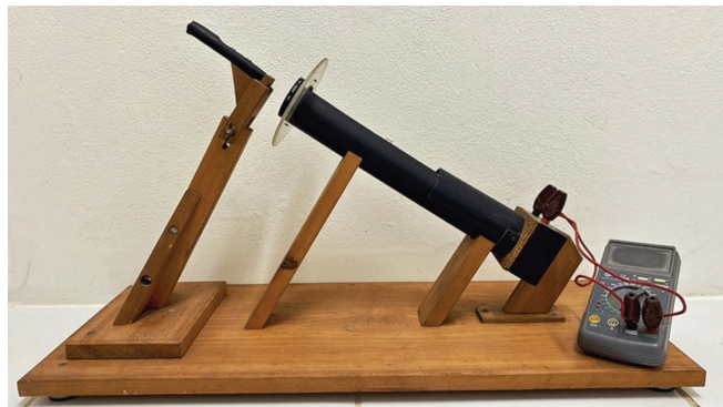
Figure 2. Educational polarimeter constructed with low-cost materials

The educational polarimeter constructed with low-cost materials is showed in Figure 2.