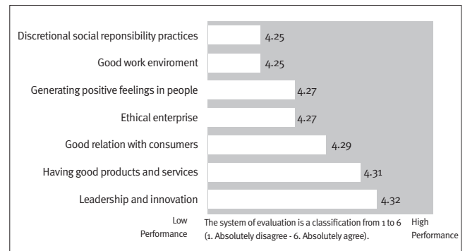
Figure 2. General public’s perception about organization’s performance on the seven index attributes

Figure 3 shows the economic sectors with the best reputation scores, on average: the media, food, and beauty sectors. The public services sector ranked last, followed by the mining and retail sectors.