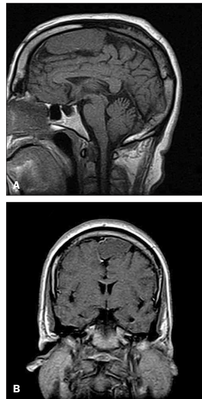
FIGURE 1 T1-weighted MRI shows an isosignal tumor from the falx cerebri to the left. A: sagittal view; B: coronal view.

On the histopathologic analysis, the lesion consisted of lobules of hypocellular mature hyaline cartilage with abundant blue-grey chondroid matrix punctuated by in-