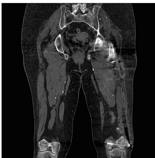
FIGURE 2 Coronal view of multi-slice CT scan showing calcifications in the muscle groups of the thighs in more detail.