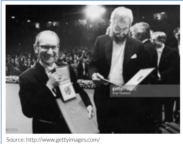
Figure 2. César Milstein and Georges Köhler receiving the Nobel Prize.

Active immunity can be defined as the protection provided by antigenic stimulation of the immune system with the development of a humoral (antibody production) and cellular response. This stimulation can occur by natural infection or by using a vaccine.