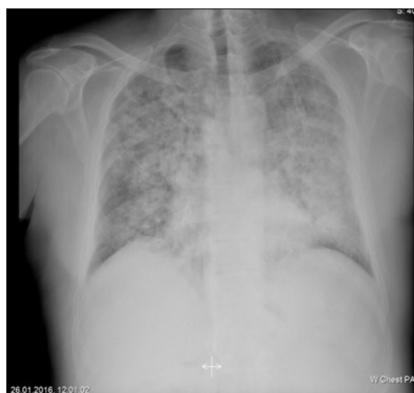
FIGURE 2 Chest X-ray showed progression of lesions.