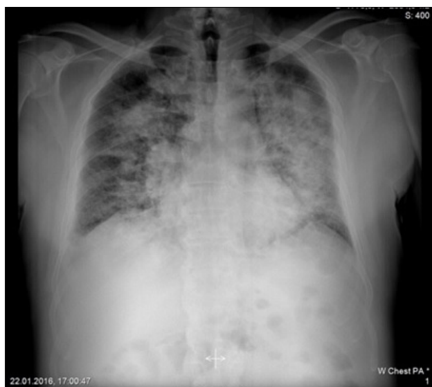
FIGURE 1 Initial chest X-ray showing diffuse bilateral nonhomogeneous, irregular interstitial infiltrates.