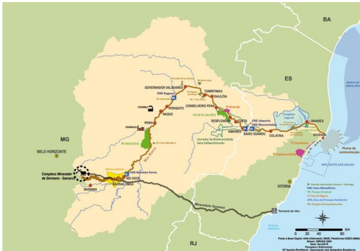
FIGURE 2 MAP WITH THE LOCATION OF THE MUNICIPALITIES IMPACTED IN THE DISASTER