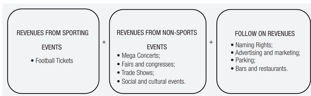
FIGURE 1 POSSIBILITIES OF GENERATING REVENUES FROM PPP STADIUMS AND PRIVATE ARENAS

Based on the diversified revenue indicator, it can be seen that PPP stadiums and private stadiums have a great potential for generating alternative operating revenues (Figure 1), while sports arenas under traditional public management cannot charge additional revenue for the commercial operation of public equipment due to the limits imposed by Federal Law No. 8.666 of 1993. In this way, private stakeholders can reduce the uncertainties associated with operating revenues from the football box-office (Cabral and Silva Jr., 2013). Obtaining these revenues requires a business structure, whose competencies are rarely found within traditional public administration, which demonstrates the potential of PPPs compared to traditional public provision.