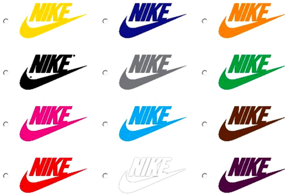
Fig. 1. Brand priming manipulation.

suspicion regarding this first stage's purpose. These two other brands were Sadia and Havaianas. Fig. 1 shows an example of the stimulus for the brand priming manipulation: