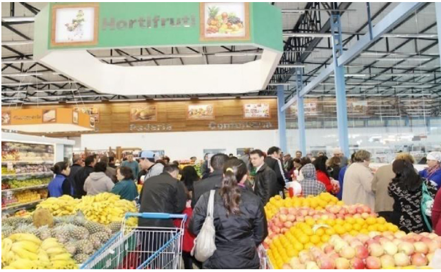
Fig. 2. Stimulus with high human density.

variation of individual emotional responses and of the respondents' perception.