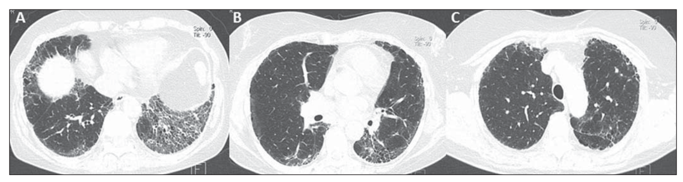
Figure 1. HRCT of the lower (A), middle (B) and upper (C) thirds of the lung.

to undergo high-resolution computed tomography (HRCT) (Figures 1, 2 and 3).