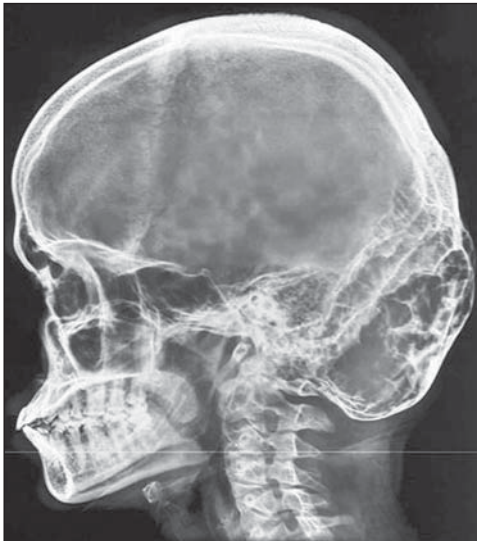
Figure 1. Lateral X-ray of the skull, showing a large, ill-defined, well-demarcated, expansile, multiloculated osteolytic lesion in the occipital bone.