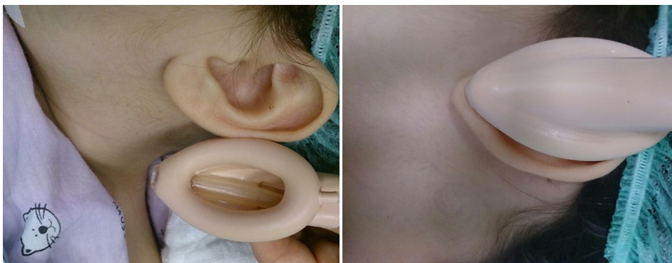
Figure 2 Selection of the PLMA.

After completion of the surgery, the weight-based and auricle-based PLMA selection techniques were compared with the PLMA selection according to age.