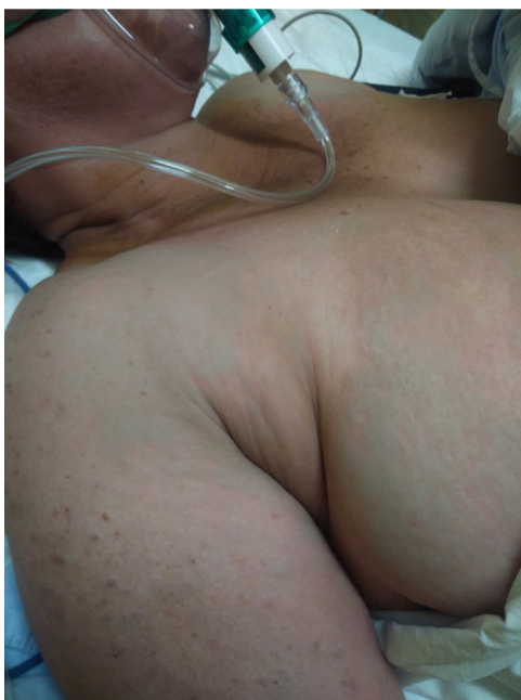
Figure 1 Blue maculopapular rash in the shoulder and right breast.

improvement. Other possible causes such as hemorrhagic complication, local anesthetic system toxicity or pulmonary embolism were considered, but excluded when the rash became evident.