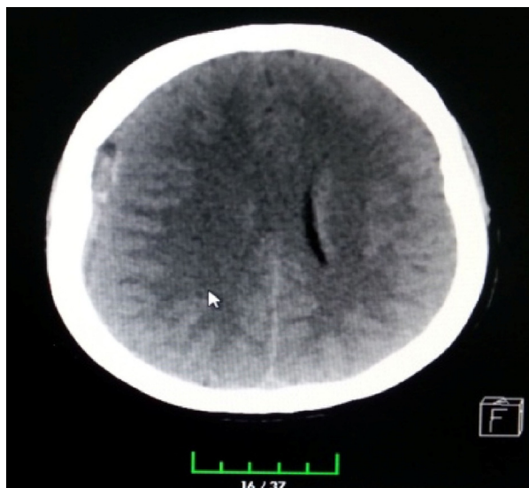
Figure 1 CT scan showed a right subdural hematoma.

>5 d. 6 In a study including 640 patients, postural headache continued for 15 days in one patient, although no lesion was visible in brain MR and the headache improved after only two epidural patches. 6