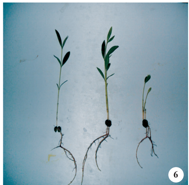
Figures 5-6. 5. Speed of germination at 20th days after sowing. 6. Polyembryonic behaviour at 30th days after sowing.