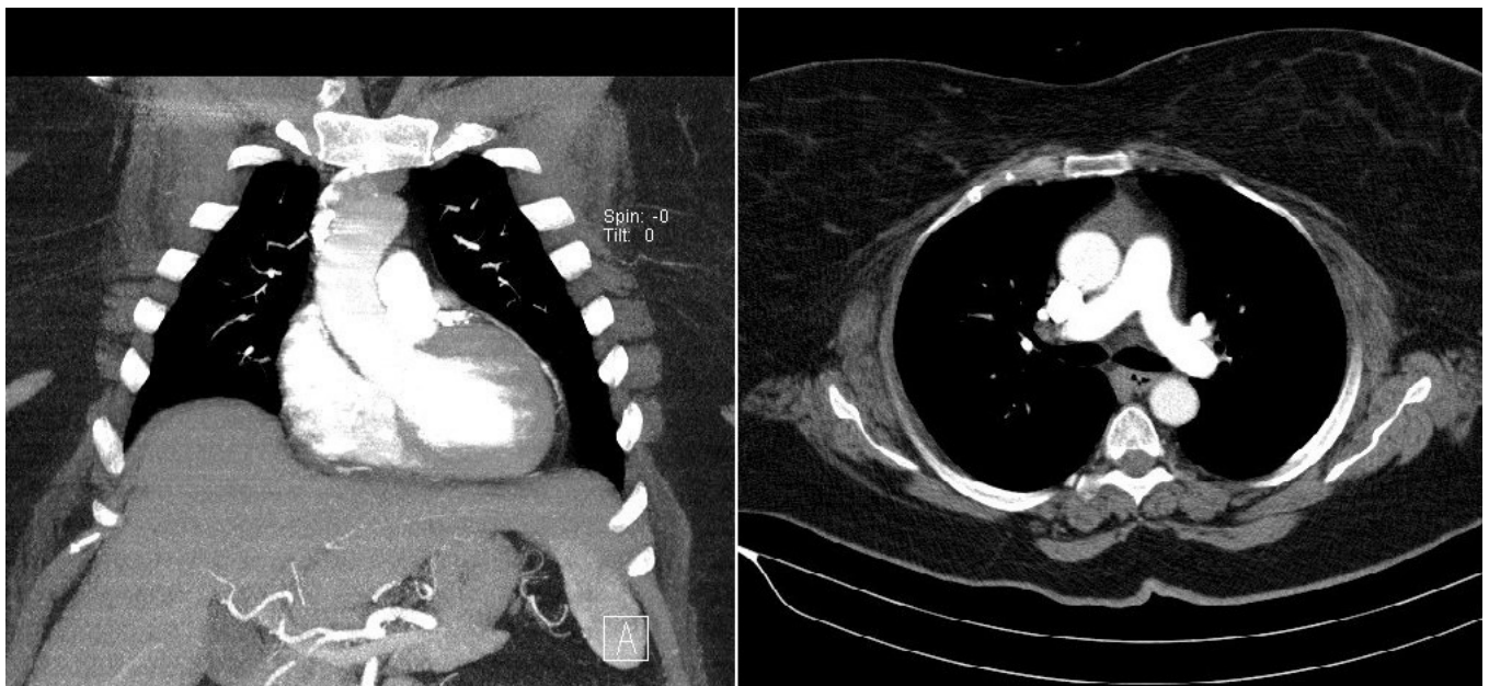
Fig. 1 - Preoperative computed tomography scan. Patients are suitable for this procedure if, at the level of the main pulmonary artery, the ascending aorta is rightward.

All patients received the same medications, including propofol (2-3 mg/kg), fentanyl citrate (10-15 \mu\text{g/kg} ), and pancuronium bromide (0.1 mg/kg). Following endotracheal intubation with a left-sided double-lumen tube, the anesthesia maintenance dose included intravenous propofol (2-5 mg/kg/h) and fentanyl