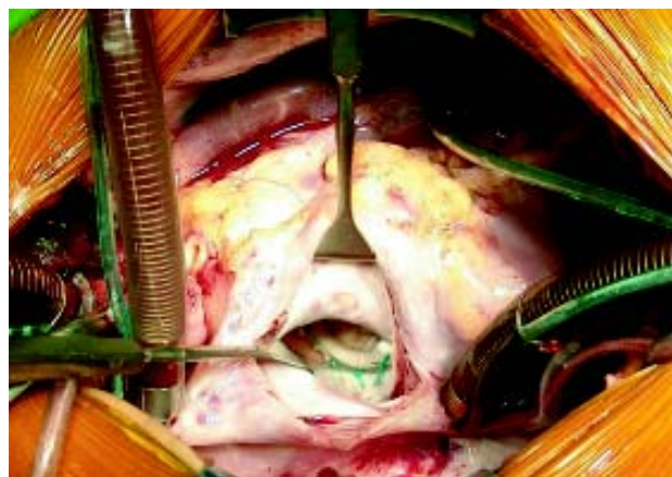
Fig. 1 - Gregori's ring utilized in the mitral valve plasty seen through the lengthwise opening in the interatrial septum

Sinusal rhythm was observed with a heart rate of 70 beats per minute. The QRS complex axis was +60° with a PR interval of 0.20s, QRS of 0.08s and QTc of 0.33s. A left atrial overload was evidenced by a biphasic P wave at V1 with a greater