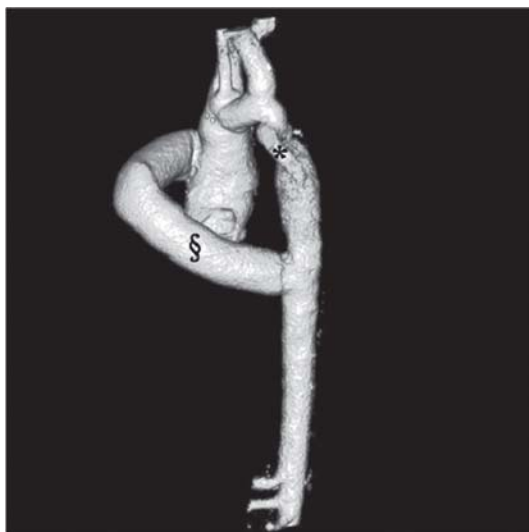
Fig. 2 - Postoperative chest computed tomography with three-dimensional reconstruction, showing patent ascending aorta to descending aorta extra-anatomic bypass (§), the previous obstructed graft (*) and involution of all aneurysms

Although the anatomic repair was initially contemplated as a primary option, the presence of a previous thoracotomy, with known aneurysmal collateral arteries and possibly dense adhesions changed our plan. Under general anesthesia, a median sternotomy was constructed, and a 26-millimeter ascending aorta to descending aortic knitted double velour graft (Boston Scientific, Natick, MA) was performed with the aid of standard cardiopulmonary bypass. His postoperative recovery was unremarkable, being discharged home on the eighth day in good condition.