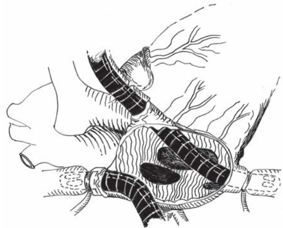
Fig. 3 - Cannulation of the superior vena cava through itself and cannulation of the inferior vena cava through the right atrium

In cases where transtricuspid access was necessary, cannulation of the superior and inferior vena cava were performed through the superior vena cava, so that the cannula for the inferior vena cava did not obstruct the view of the tricuspid valve (Figure 2). This tactic was used in two cases of closure of IVC, one with concomitant tricuspid valve surgery. Finally, in patients who had to open the right atrium, but without the need to transtricuspid approach (patients who underwent IAC), was performed cannulation of the inferior vena cava through the right atrium and cannulation of the superior vena cava through such vein (Figure 3). When necessary lacing the inferior vena cava, this was performed only after starting of CPB.