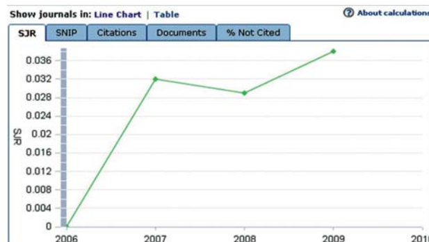
Fig. 1 - Graphic showing the increase of the number of citations of BJCVS in the database Scopus between 2006 e 2009

But there are still more citations, the level of the articles should be even better. And one way to accomplish this is to be rigorous in the reviews. The