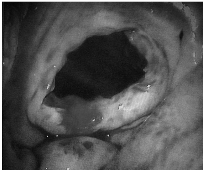
Fig. 2 – This technique provides good visibility