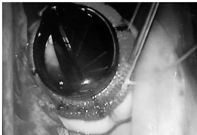
Fig. 3 - Fixing the prosthetic valve