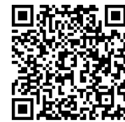
Video 1 - Chest CT revealing multiple peripheral ground-glass opacities.

in surgical patients without COVID-19 as well as in COVID-19 patients without surgery. This may be related to impaired immune function [6] and early systemic inflammatory response due to surgery [7] .