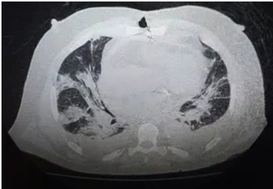
Fig. 2 - Chest CT revealing multiple peripheral ground-glass opacities.