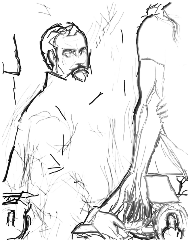
Fig. 1 - Painting showing Andreas Vesalius in his dissection activity (Adapted [11] ).

Andreas Vesalius was born on December 31, 1514 in Brussels, Belgium, being the son of a family of physicians where both his father and his grandfather had served the emperor of the Holy Roman Empire. (Figure 1)