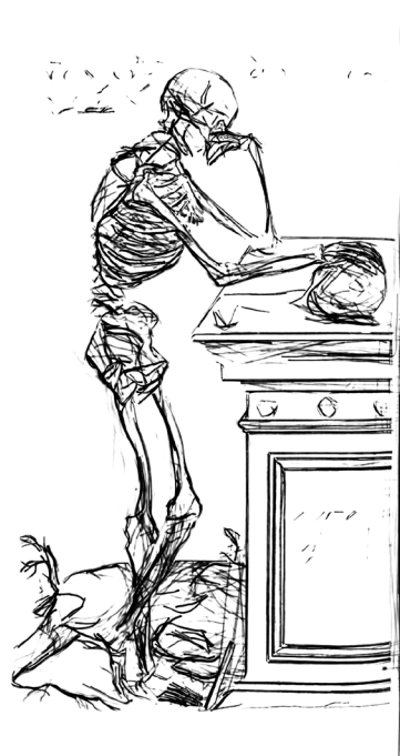
Fig. 2 - Cover of his work De Humani Corporis Fabrica (Adapted [11] ).

universities and libraries across Europe and the United States showing the rarity and historical importance that the work has even after 459 years of its publication [4,5,7-9] . (Figure 3)