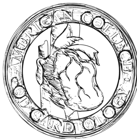
Fig. 4 - Seal of the American College of Cardiology (Adapted [11] ).

The genius of Vesalius's work has been recognized not only by the scientific community, but by the different nations, whether in the form of stamps, notes, cultural or scientific events (Figure 5).