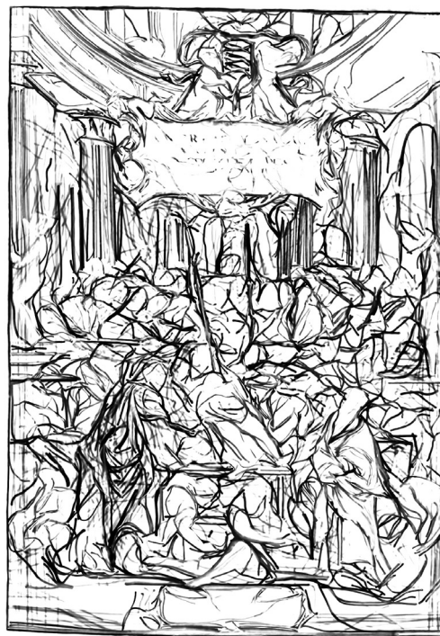
Fig. 3 - Illustration of Andreas Vesalius's work in an amphitheater (Adapted [11] ).