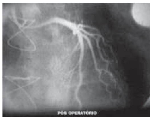
Fig. 2B - Post-operative angiography of the left coronary artery fistula to the pulmonary branch.

The presence of left-right shunts can occasionally lead to the appearance of congestive heart failure, acute myocardial infarction, bacterial endocarditis, formation and rupture of aneurysm and sudden death [13,16-19]. The incidence of these complications increases proportionally with the age of the patients [3,7,12].