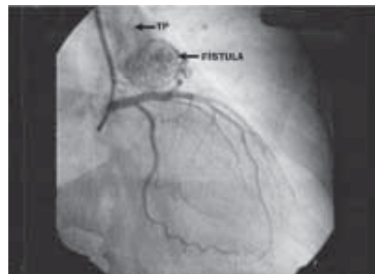
Fig. 1A - Pre-operative angiography demonstrating a left coronary artery fistula to the pulmonary branch (TP) (case 3).

Neither associated cardiac nor obstructive lesions were found. Two patients presented with isolated right coronary arterial fistulae to the pulmonary artery and the other had bilateral right and left coronary arterial fistulae to the pulmonary branch (Figure 1A and 1B).