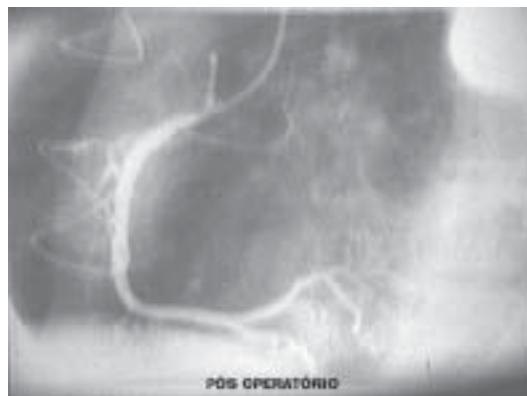
Fig. 2A - Post-operative angiography demonstrating the right coronary artery without fistulae.

Coronary artery fistulae normally have indications for surgical treatment, even though approximately 50% of the carriers of isolated fistulae are asymptomatic [11,12,15].