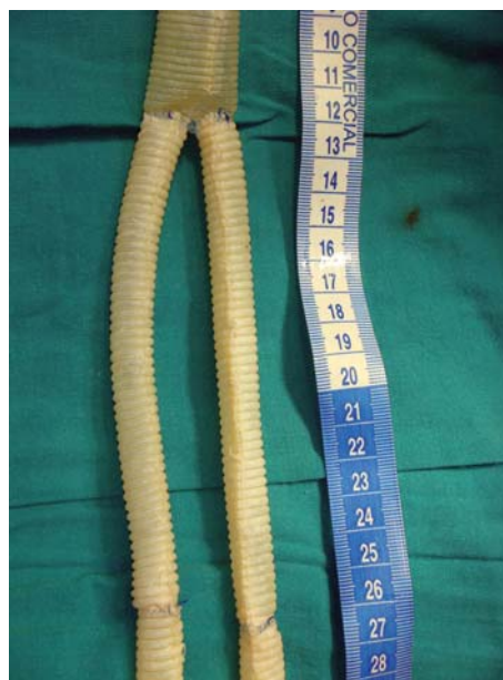
Fig. 2 - Horizontal mattress stitch in the middle of the main body corrugated bovine pericardial tubular graft to make two sides. To each orifice we sutured end to end two limbs