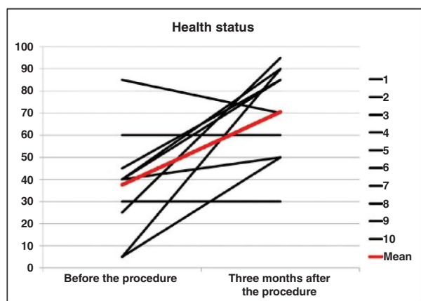
Figure 2 – Comparison of the health status before and after renal sympathetic denervation. The black lines correspond to the health status of each patient, and the red line represents the mean value.