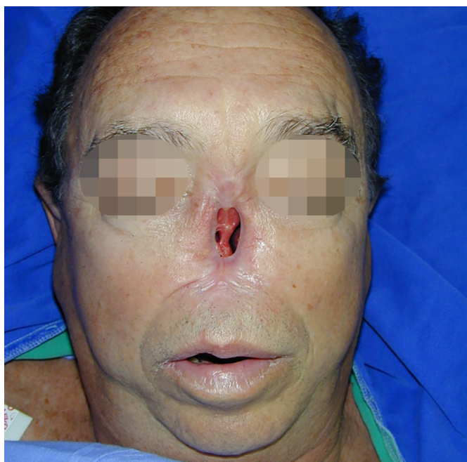
Figure 5. Preoperative aspect, consequence of total rhinectomy due to squamous cell carcinoma.