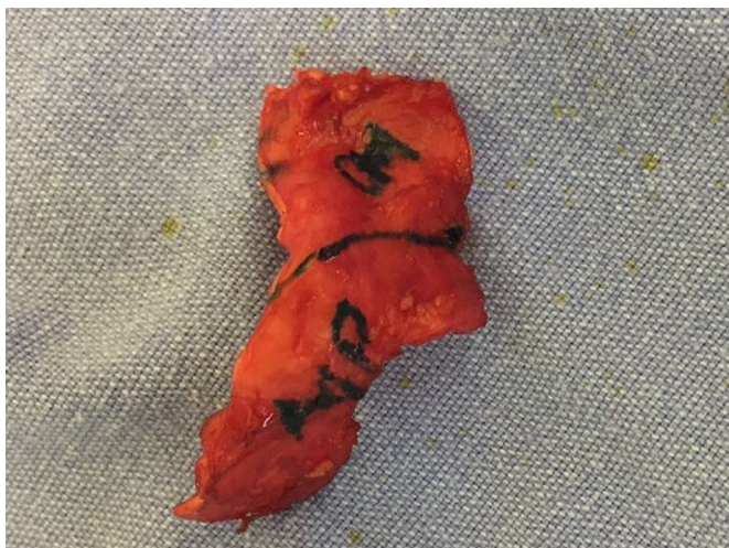
Figure 2. Modification of the Max Pereira technique by Collares - Graft.

The extension is perpendicular to the anti-helix, towards the helix branch and into the caudal direction, circumventing the auditory canal and preserving 1 mm of cartilage. The modification ends in the tragus-antitragus transition (where it will become the transition of the “neocartilage” of the lateral branch and the medial branch of the greater alar cartilage). With this extension, a block graft is obtained, which simulates a fusion of the lateral branch of the major alar cartilage with the triangular cartilage.