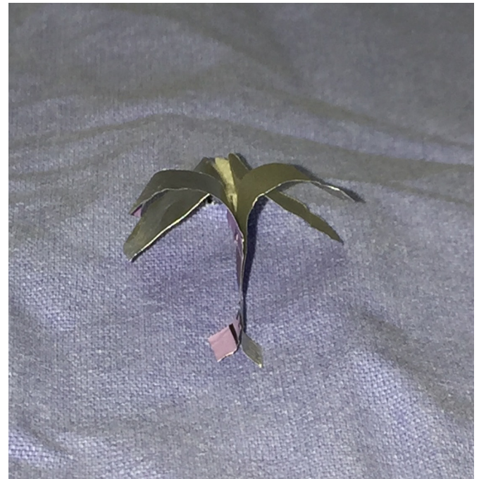
Figure 3. Modification of the Max Pereira technique by Collares - Mold.

The extension is perpendicular to the anti-helix, towards the helix branch and into the caudal direction, circumventing the auditory canal and preserving 1 mm of cartilage. The modification ends in the tragus-antitragus transition (where it will become the transition of the “neocartilage” of the lateral branch and the medial branch of the greater alar cartilage). With this extension, a block graft is obtained, which simulates a fusion of the lateral branch of the major alar cartilage with the triangular cartilage.