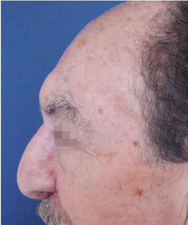
Figure 8. Postoperative aspect - Profile.