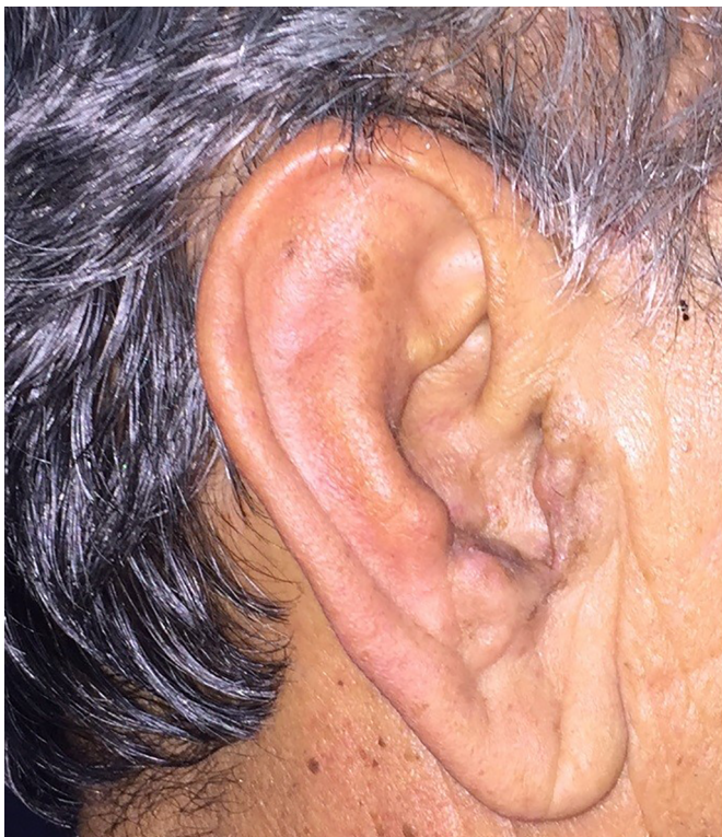
Figure 9. Ear without deformities after graft removal.

Considerations regarding the size, anatomical location, and depth of the defect that result from tumor resection will influence the treatment plan. The restoration of the nasal cartilaginous bone support is fundamental for aesthetic and functional results.