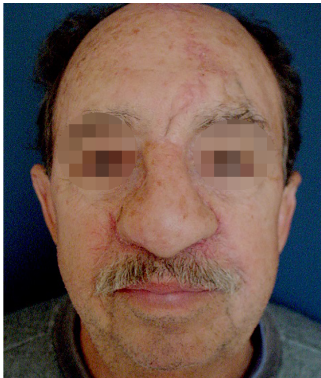
Figure 6. Postoperative aspect.

After analyzing the 10 sequential cases, we found an adequate nasal tip shape (Figures 5 to 8). The patients reported preserved nasal function and satisfactory internal nasal valve reconstruction without evidence of pinching at physical examination. There was no evidence or complaints of auricular deformities that occurred secondary to graft removal (Figure 9).