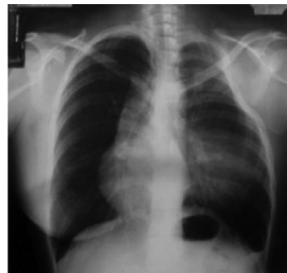
Figure 3 – Chest X-ray revealing a costal deformity on the left and deviation of the mediastinum to the right. A circular radiopaque image on the left side indicating the presence of the breast prosthesis.