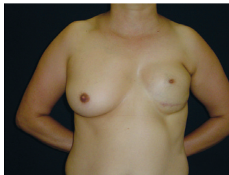
Figure 6 – One-year postoperative period.