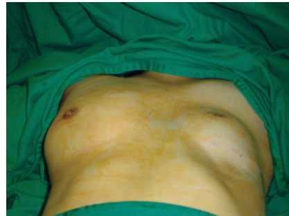
Figure 1 – Asymmetry caused by sunken chest in Poland's syndrome.

Routine preoperative examinations were performed. After analyzing the chest X-ray in the posterior-anterior view, the existence of an upper bone depression at the left side was observed, with the mediastinum deviating to the right (Figure 3). A circular radiopaque image was observed in the middle third of the left hemithorax, which is compatible with