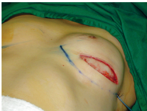
Figure 5 – Placement of the new prosthesis with a polyurethane surface with vacuum drainage of the cavity.