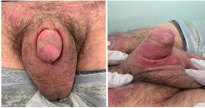
Figure 8. Surgical result - 3 months postoperatively.

micropenis since the management of pathologies is different 7 . In the case described, the differentiation was made by physical examination, in which the penile shaft of normal length was palpated but without adequate exposure due to the suprapubic adipose tissue.