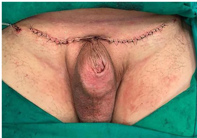
Figure 4. Result after resection and closure of the demarcated area.

We opted for resection of the foreskin due to Buck's fascia's pathological aspect and exposure (Figure 5). The anatomopathological examination of the resected specimen showed lichenoid dermatitis.