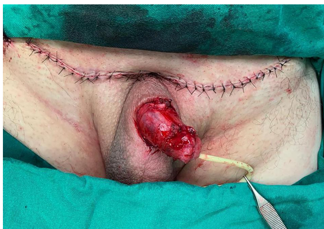
Figure 5. Penile exposure.

We opted for resection of the foreskin due to Buck's fascia's pathological aspect and exposure (Figure 5). The anatomopathological examination of the resected specimen showed lichenoid dermatitis.