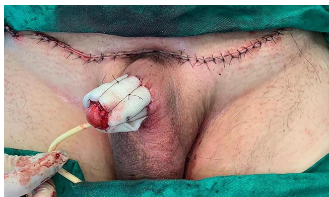
Figure 7. Dressing with non-adherent gauzes.