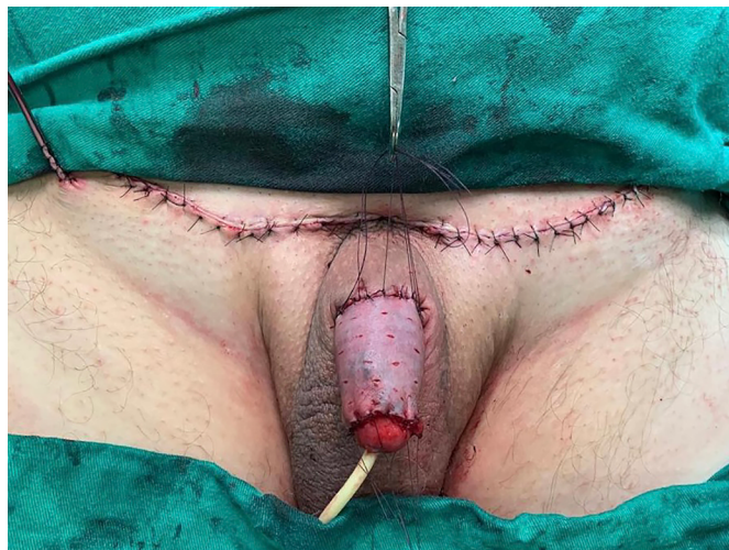
Figure 6. Positioning and fixation of the partial skin graft.

The dressing used was the Brown type. Long sutures were left to fix the slightly compressive dressing around the entire circumference of the penis using non-adherent gauze (Figure 7).