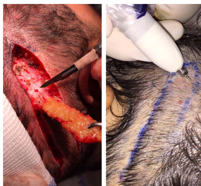
Figure 6. Methods of harvesting follicular units: on the left, Follicular Unit Transplantation; on the right, Follicular Unit Extraction.

Both FUT (a scalp strip is harvested from the temporo-occipital region, thereby leaving a thin linear scar) and Follicular Unit Extraction (FUE; numerous holes are created in the same area by micropunches, resulting in the same number of small scars, i.e., the so-called white dots) may be used as methods of obtaining follicular unit (FUs) for beard restoration (Figure 6).