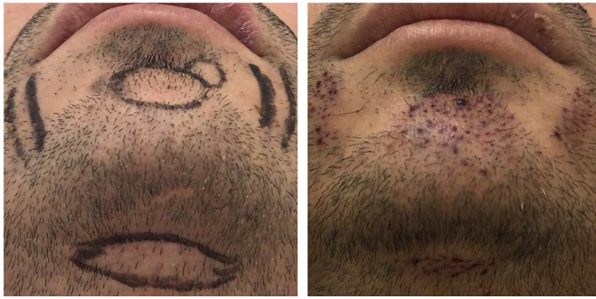
Figure 7. Follicular Unit Extraction for the correction of small patches of a thinning beard with follicular units harvested from the cervical region.