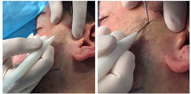
Figure 9. Correct inclination of the needle in relation to the skin. Perfect introduction of the follicular unit observing the hair angle and direction. Competent work of the assistant in pulling the skin.

The ergonomics, comfort, and position of the patient and the surgeon are key variables in the progress of the surgery. The work of the first assistant, which is to maintain the facial skin stretched throughout the surgical procedure, enables a more efficient dynamics for correct graft positioning, facilitating precise maneuvers of the surgeon required for beard transplantation surgery, which lasts for at least 6 hours when performed by an expert.