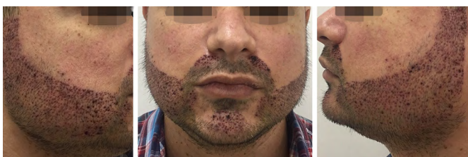
Figure 11. Appearance 24 hours after surgery. Discrete ecchymosis and edema.

black hairs are more difficult to prepare and cosmetically less interesting than hairs with smooth and straight roots.