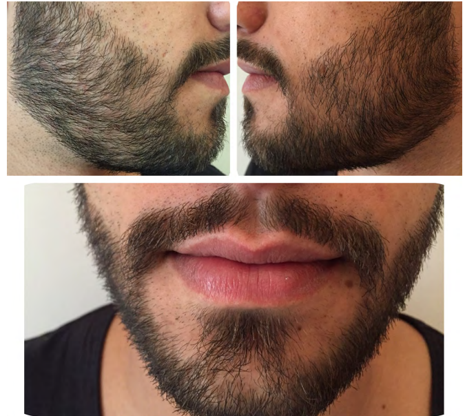
Figure 2. Most common pattern of beard hair direction.

Planning is crucial for surgical success. The mapping of the beard into different facial segments, always including the mustache and goatee, shows that the direction of the beard hair growth is individual (Figure 1). However, there is a pattern repeated in a significant part of the sample (Figure 2), which tremendously facilitates planning and drawing of the new beard in beardless patients during the consultation (Figure 3).