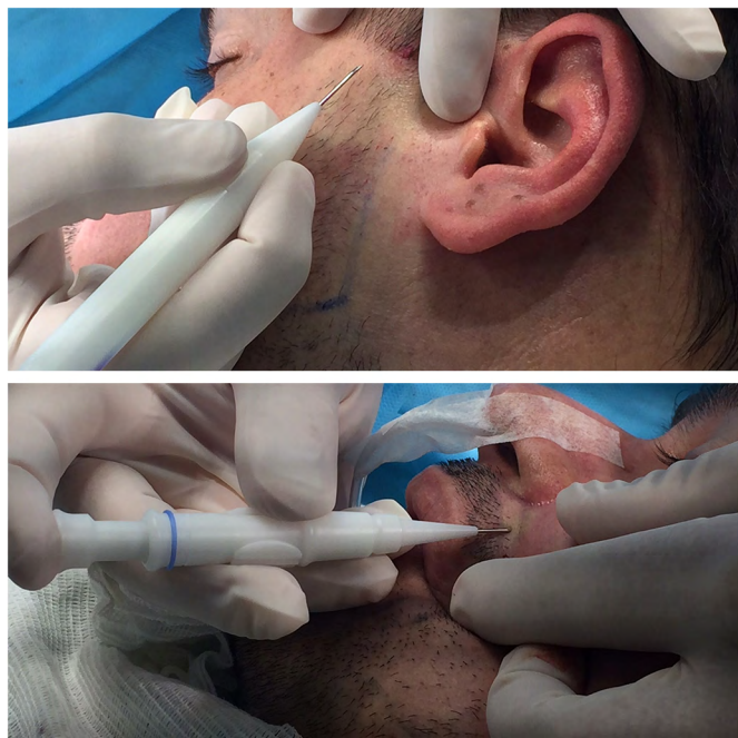
Figure 10. Above, Lion scalpel coupled to a 30 × 0.8-mm needle. Below, Implanter coupled to a 0.8-mm needle.