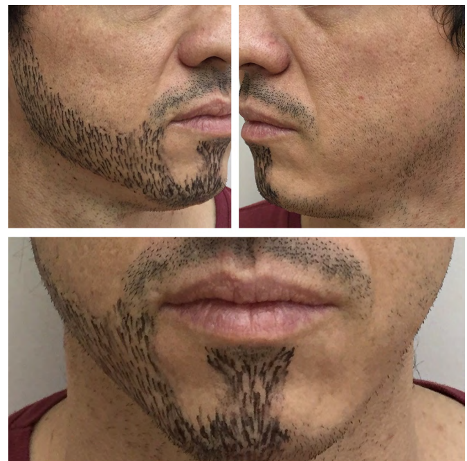
Figure 3. Preview of the new beard in a beardless patient during a consultation.