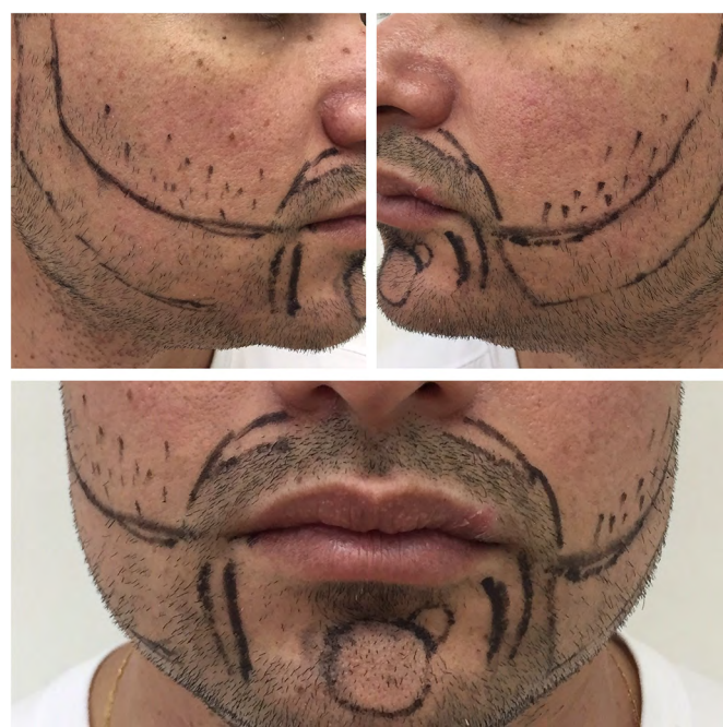
Figure 5. Preview of beard transplantation in a patient with a patchy beard.

Routine preoperative examinations are necessary. Well-equipped clinics or hospitals and anesthesiologist-assisted local anesthesia induction with sedation are preferred by the author, mainly because this surgery is a long, thorough, and highly laborious surgical procedure, requiring a trained and technically well-prepared team and a suitable surgical arsenal for the success of the procedure.