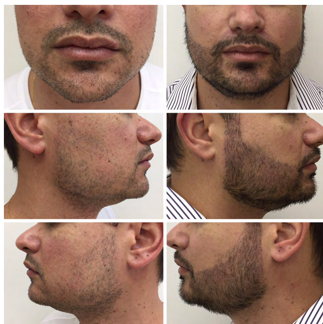
Figure 13. Pre- and post-operative photographs with 8 months of progression.

cal appearance when shaving, the beard becomes part of their new lives and may indelibly affect their personalities. Very young patients should be carefully followed up by the surgeon, and more than one interview is necessary for the correct surgical decision and should be shared with parents and guardians if possible.