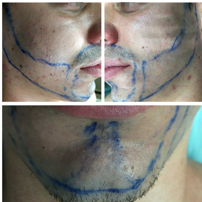
Figure 4. Preview of the new beard lines in a beardless patient.

Patients commonly ask for an inverted triangle shape of the beard connecting the lower lip to the goatee (Figure 4). A few sparse hairs, scattered in the genic area above the marking line, provide a natural appearance and may be scraped off if necessary. In patients with a patchy beard, it is particularly important to follow the marking lines and the direction of the original hair, which would facilitate preoperative understanding (Figure 5).