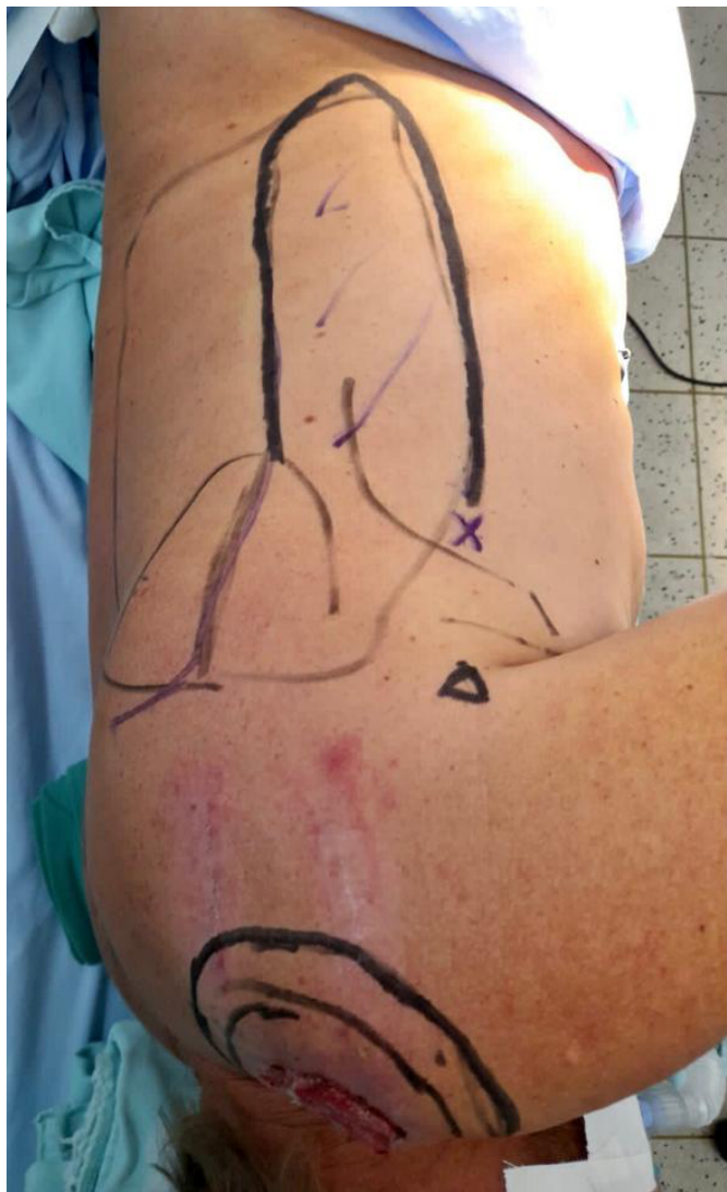
Figure 3. Demarcation of the parascapular flap.

greater ability to cover large areas, in addition to muscle preservation compared to other myocutaneous flaps, which generate great functional loss, requiring long periods for compensation, as is the case with the latissimus dorsi 6 and trapezium flaps 7 .