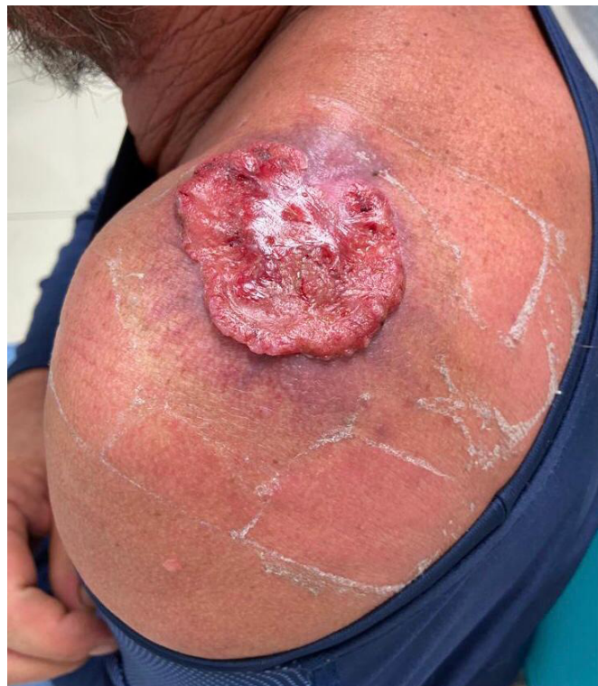
Figure 1. Ulcerated lesion measuring 5.7 x 5.2cm.

The patient was followed up, requiring radiotherapy treatment, with good evolution and adequate surgical wound healing (Figures 10 and 11).