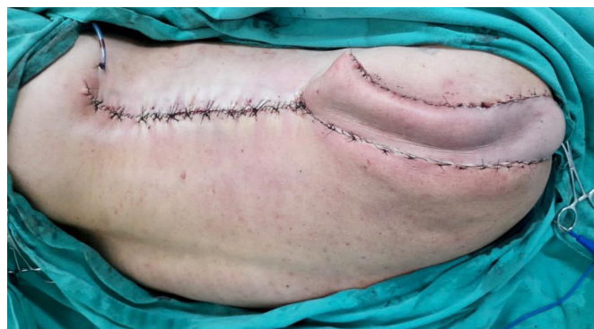
Figure 5. Elevation and rotation of the parascapular flap.

Wound closure by skin traction, recommended in 2004 by Carlos Henrique Fröner S. Góes et al. 3 , was performed in the ward on the second postoperative day to correct the dehiscence. For this purpose, Prolene 2 thread was used, with insertion in the area posterior to the detachment, exteriorizing it inside the wound, towards the other margin, and the thread is wrapped through the needle with a catheter segment. A "U" was completed bilaterally by returning the thread in