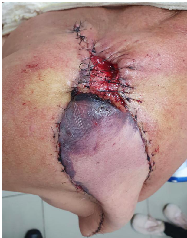
Figure 8. Use of the Góes Suture for partial closure of the dehiscence.