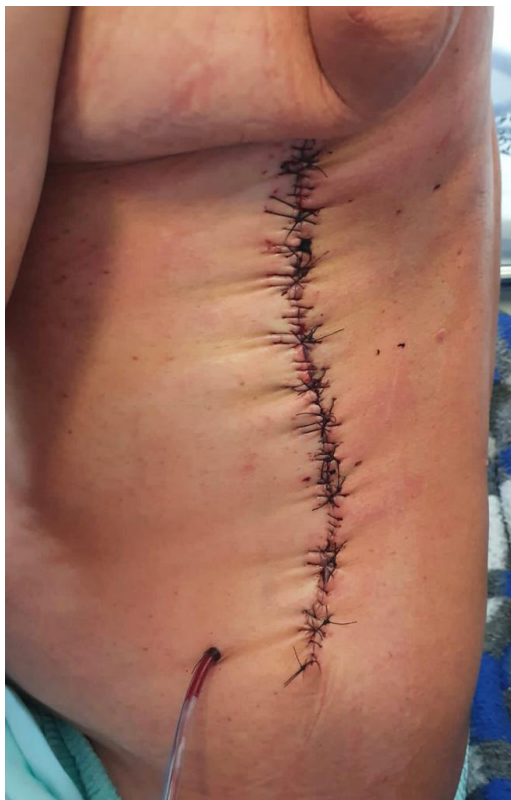
Figure 6. Donor region repair with 3-0 and 2-0 nylon.