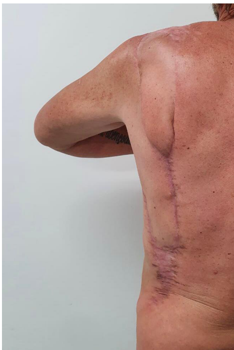
Figure 11. Late postoperative after radiotherapy.

reverse. The two threads on each side were pulled simultaneously, bringing the edges together with a certain point of maximum tension. Through repeated traction, greater skin relaxation and the possibility of partial closure were promoted. This avoided performing a new procedure in a surgical center, which would cause great emotional stress to the patient and higher costs to the institution that maintains it.