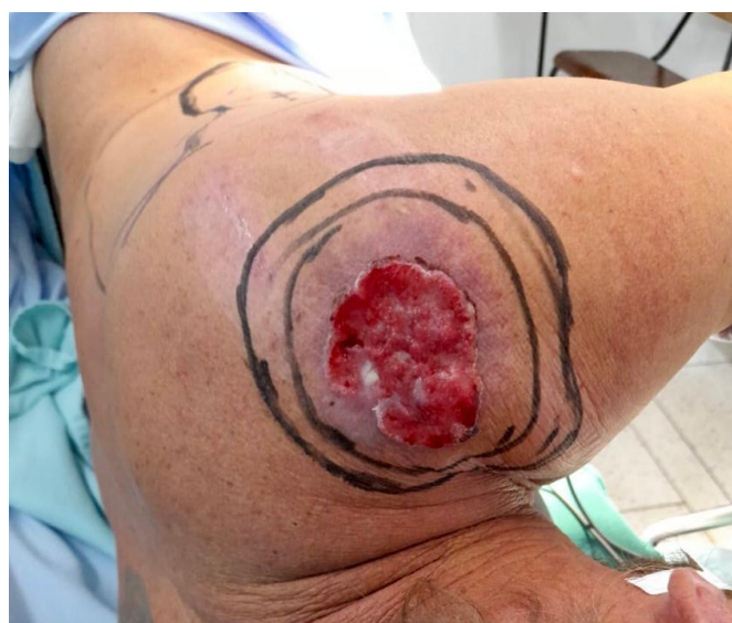
Figure 2. Patient in surgical positioning.