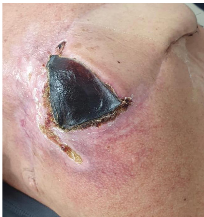
Figure 9. Dry necrosis at the distal end of the parascapular flap.