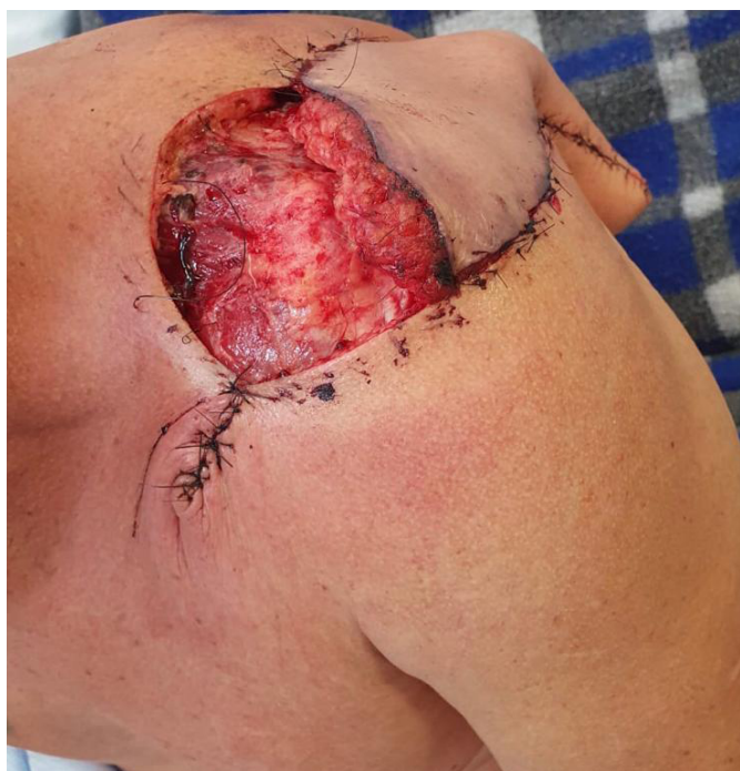
Figure 7. Dehiscence at the distal end of the parascapular flap.