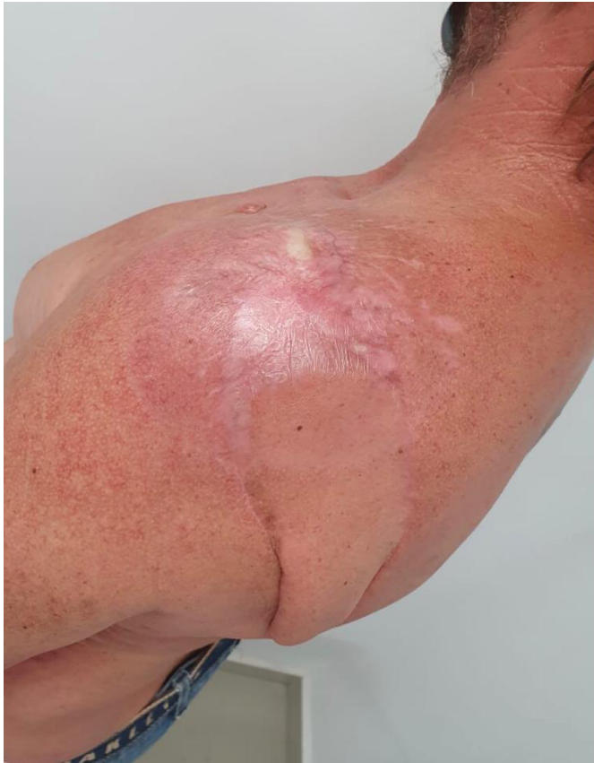
Figure 10. Late postoperative after radiotherapy.