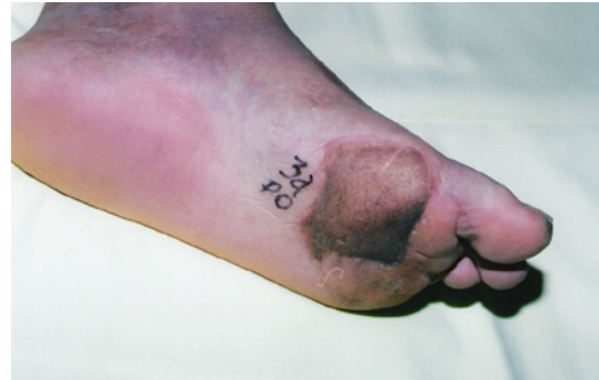
Figure 1 – An electric current burn in the plantar region covered with a lateral arm flap after a post-operative period of 3 years.

In the surgical treatment of cervicothoracic adhesions, which lead to significant limitations related to neck extension at varying degrees, the use of skin grafts or local flaps to replace the scar tissue has been questioned after consideration of the short- and long-term aesthetic and functional results. This procedure thus requires improvements, and new strategies aimed at increasing cervical extension in the presence