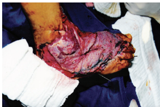
Figure 4 – Dorsum of the foot and ankle covered with a latissimus dorsi flap.