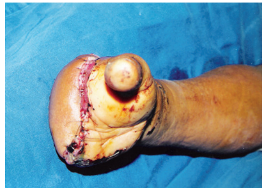
Figure 3 – Transmetacarpal amputation covered with a lateral arm flap in a victim of an electric burn.

Microsurgical flaps are indicated for complex reconstructions in burn patients, especially when the lesions involve noble structures and joints. Clearly, this is an exceptional procedure adopted only when simpler techniques,