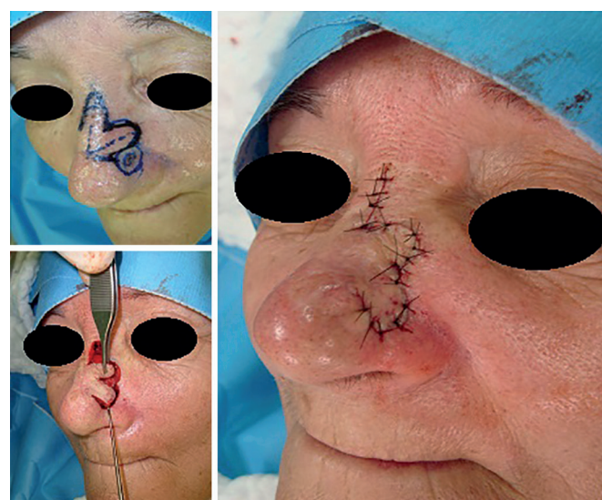
Figure 3. Patient who received a bilobed flap for correction of defect due to squamous cell carcinoma in the nasal wing.

In the nasal dorsum, there were 17 (47%) primary closures, 6 (17%) bilobed flaps, 5 (14%) Rintala flaps, 2 (6%) each of glabellar, grafts, and closure by the third