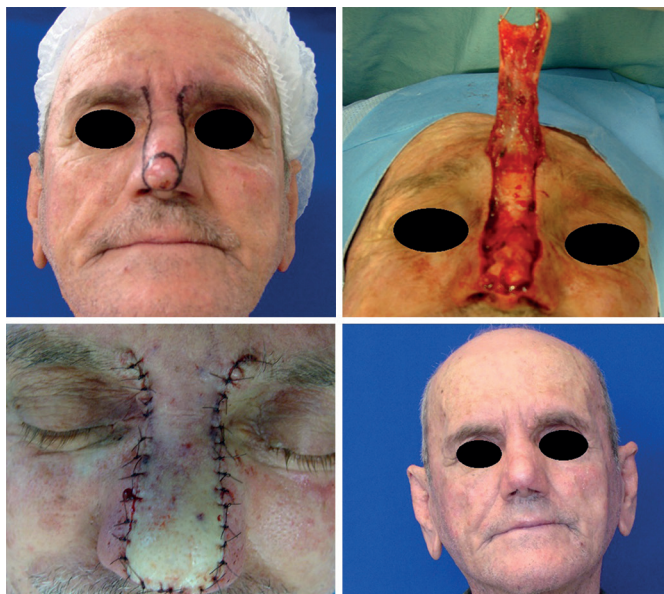
Figure 5. Patient who received a Rintala flap for correction of defect due to squamous cell carcinoma in the nasal tip.

In the nasal tip, primary closure was performed in 16 (62%) cases, Rintala flap in 5 (19%), bilobed nasal flaps in 3 (12%), and tertiary closure and graft in 1 case each (4%) (Figure 5).