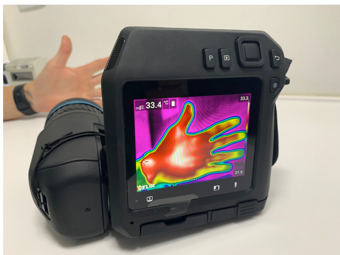
Figure 2. Thermocamera Flir® model T540sc (Flir Systems Inc, Wilsonville, OR).