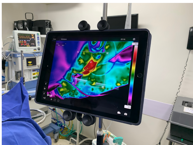
Figure 4. Tablet with Bluetooth transmission of the images of the thermocamera, in front position to the surgeon.

was used to cause skin retraction was made with the tip directed against the deep dermis at the linear 5 centimeters speed every 1 second.