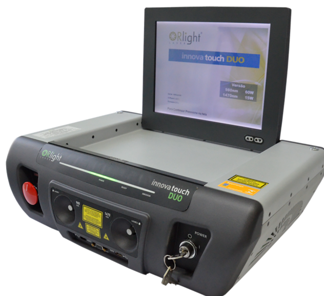
Figure 1. Orlight diode laser® Duo 980nm.

Eighty-three patients were submitted to laserlipolysis with the Orlight® Duo 980nm diode laser (Figure 1), between July 2017 and June 2019, at the Hospital da Plástica, São Paulo/SP. All patients in the study signed the consent form, and the study received approval from the ethics committee under number 0126/2019. The age range of the patients ranged from 17 to 75 years. All patients were female.