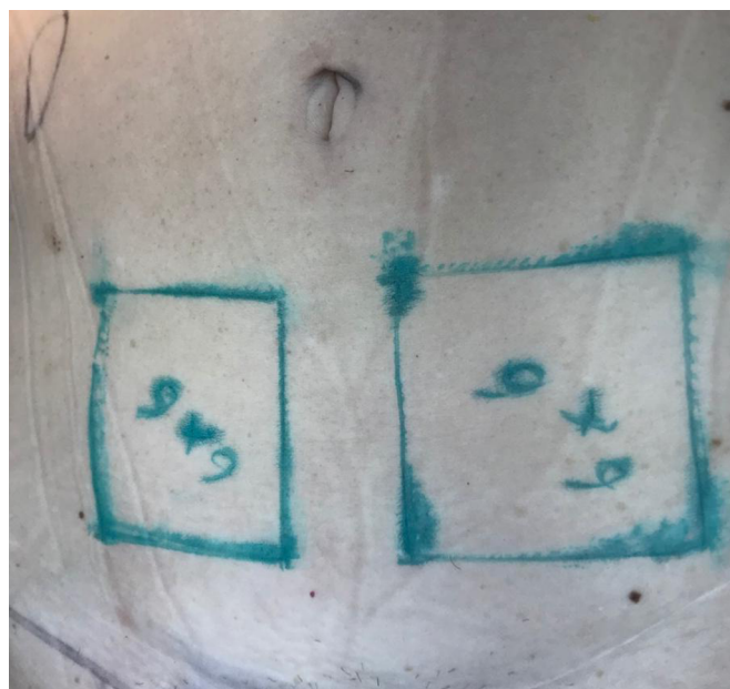
Figure 6. Prior marking of abdominal flap areas to be tested for burn after resection of classical dermolipectomy.

The laser was applied to the deep dermis of abdominal flaps of patients undergoing dermolipectomy to determine the temperature that causes skin burns, totaling 27 cases. According to a previously standardized back table technique, the temperature was measured immediately after resectioning the abdominal flaps, with marked areas of 6x6cm bilaterally (Figure 6).