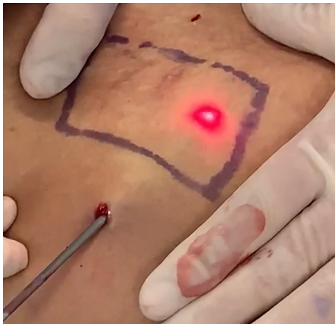
Figure 7. Determining the burn temperature with the laser in the flaps of dermolipectomy in back table.