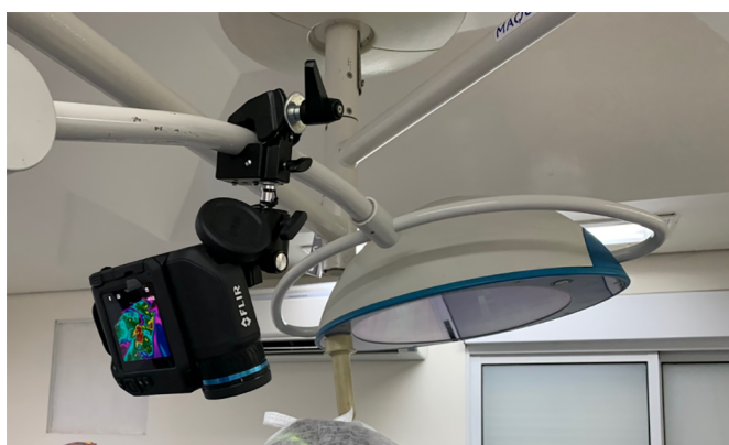
Figure 3. Fixation of the camera in the surgical focus.