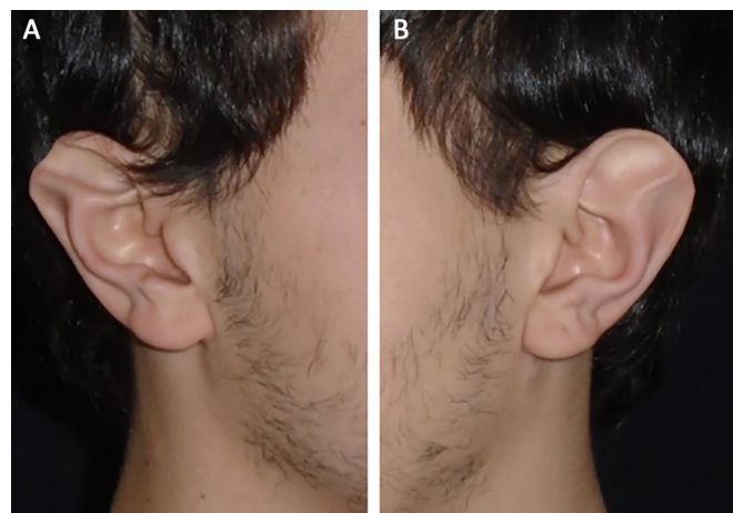
Figure 1. Antihelix third root found in Stahl's ear. A: Right ear, B: Left ear.

Closing of the posterior incision was performed using a Greek bar suture with 4-0 polyglactin. Ear dressings were made with sterile bandages and maintained for 48 hours. The same procedure was