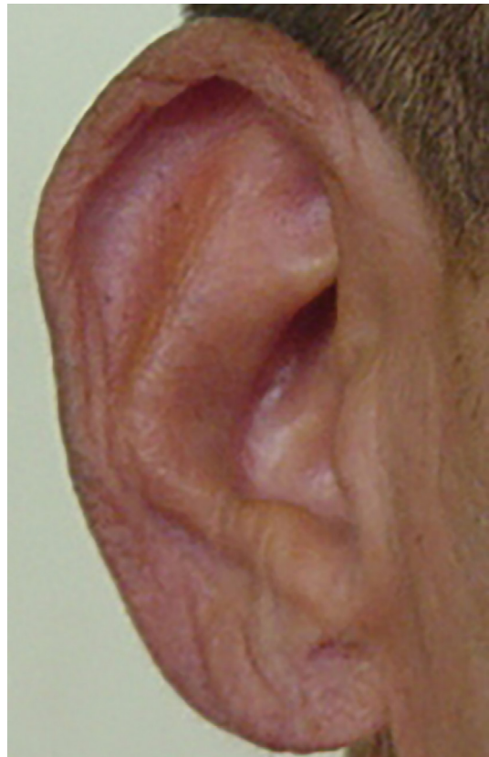
Figure 5. Right ear - postoperative - oblique angle.