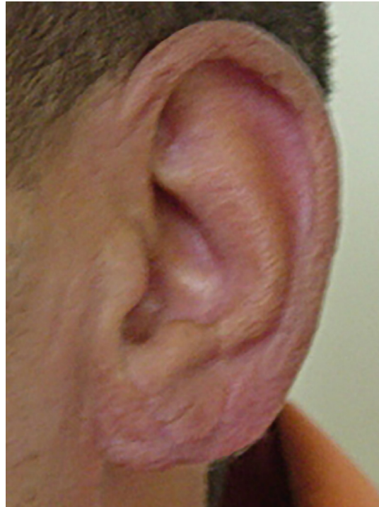
Figure 4. Left ear - postoperative - oblique angle.

Over the years many techniques have been developed by various authors to resect portions of the earlobe 1,9 . These techniques have been modified and new ones have been developed and used to correct earlobe hypertrophy. These techniques are not exclusive