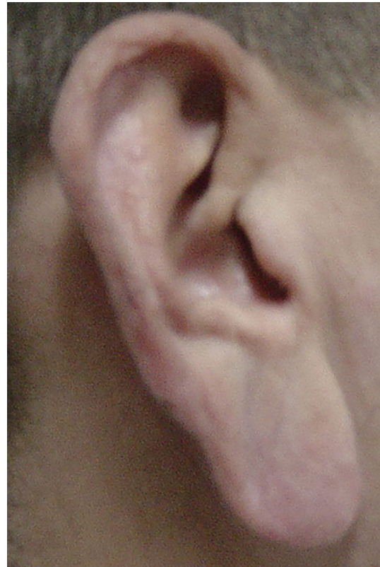
Figure 2. Right ear - preoperative.

One of the most crucial procedures in the preoperative period was the earlobe marking. During marking three points were established, points X, Y and Z. This technique establishes three points that