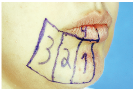
Figure 2 – Anatomical regions tested were: (1) the medial, (2) paramedial, and (3) mental foramen sections of the chin and (4) the lower lip vermillion section.

The test started with the thinner filament, followed by filaments with progressively increasing thickness. The patient was asked to answer yes when the touch of the monofilament was felt. Then, a filament immediately thicker was tested, but only in the areas without positive response to the previous filament. Each stimulus was maintained for approximately 1.5 seconds, and articulate movements were avoided during use of the monofilaments. For each tested monofilament,