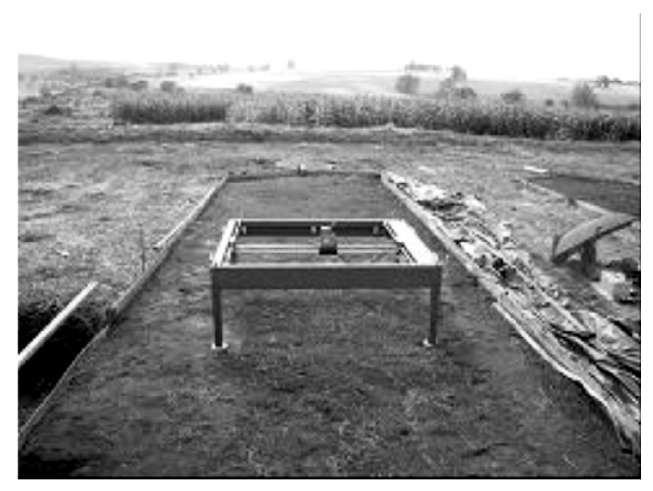
Figure 1. Laser profile scanner installed on one of the experimental plots.

The soil surface roughness index (RR) was calculated by the method of Allmaras et al. (1966), modified by Currence & Lovely (1970), by multiplying the standard deviation of the elevation logarithms by the mean elevations. With the same data, the tortuosity index (T) was calculated as proposed by Boiffin (1984), as the ratio between the soil profile