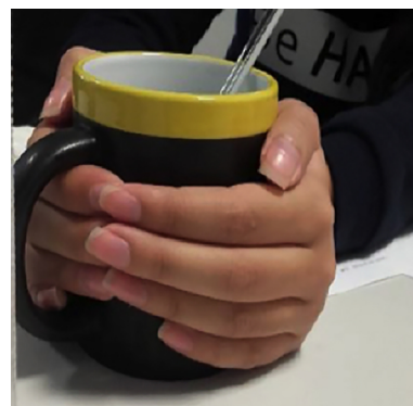
Figure 2: Illustration of experimental procedure B.

G2: “[...] we took the four cups of the different materials [...] Then we took the water from the refrigerator, we measured its temperature