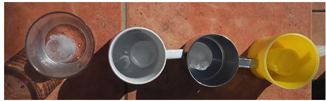
Figure 3: Illustration of the experimental procedure C.

** I.V.: independent variable; D.V.: dependent variable; C.V.: control variable