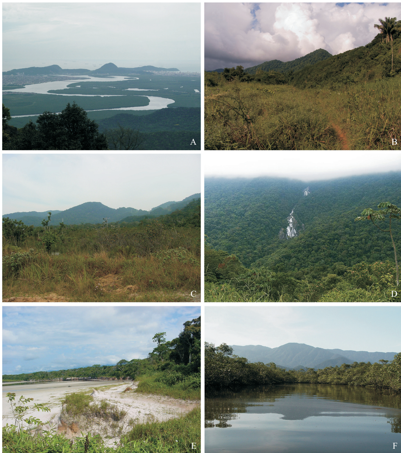
Fig. 2. Overview of the main landscapes in the Baixada Santista region. For vegetation description and site details see text and Table I. A. General view of the region showing the large mangroves: hills in the horizon are the Japuı-Xixová State Park; B. Secondary open vegetation and lowland rainforest: Morro do Japuı; C. Restinga vegetation: Bertioga; D. Submontane dense rainforest: slopes near Fazenda Acaraú; E. Dune and restinga vegetation: Praia de Itaguaré; F. Mangroves: Praia de Itaguaré.

ally undersampled, or not even considered in some studies (e.g. Almeida et al. 1986; Paz et al. 2008). We believe that a higher numerical dominance of the Hesperiidae is expected in all complete or near-complete butterfly surveys.