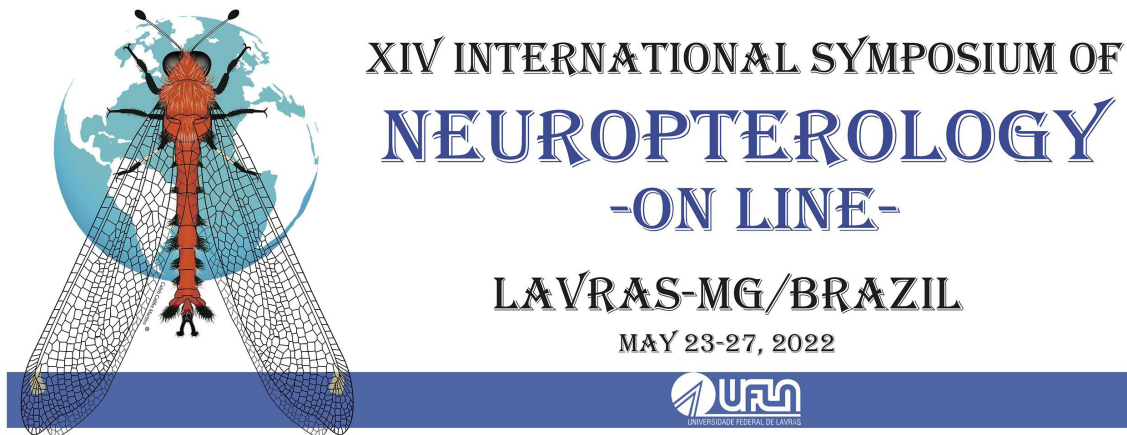
Figure 1. Logo of XIV International Symposium of Neuropterology represented by Albardia furcata van der Weele, 1903 (Neuroptera, Myrmeleontidae, Ascalaphinae). ©Caleb C. Martins.