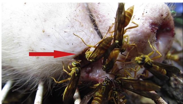
Fig. 2. Arrow pointing biotaphonomic activity of specimens of Agelaiia fulvofasciata .

Specimens of A. fulvofasciata (Fig. 1) were observed grouped in the oral, ocular and anal regions of the pig model one day of postmortem (Fig. 2). The wasps took parts of the tissue from the lower lip causing injuries, similar to lacerations, measuring