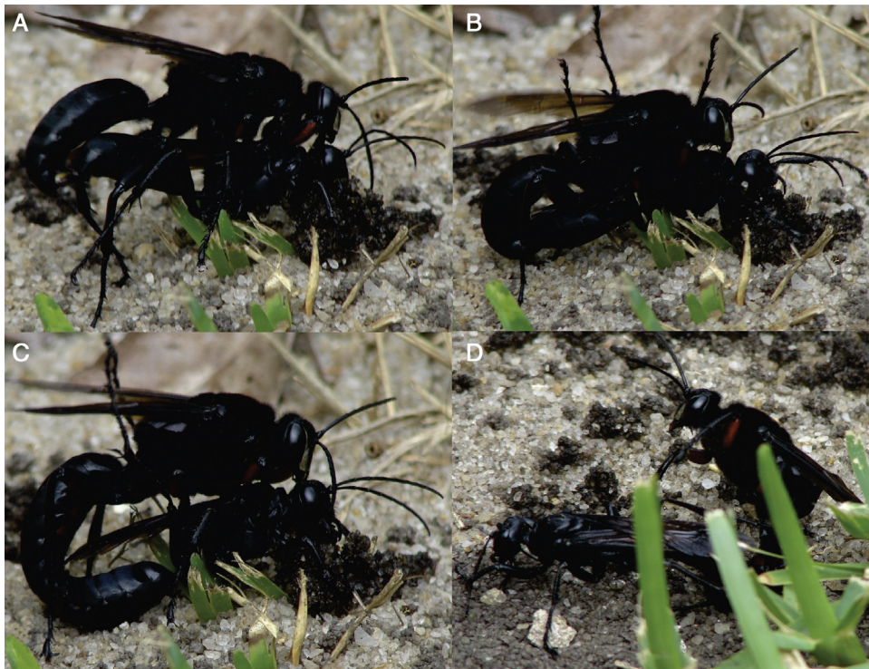
Fig. 3. Sequence of the copulation phase: (A) beginning of aedeagus intromission. Copulation during nest digging – female carrying a clod of sand. (B) Connubium, gaster's contraction movements. (C) Connubium, gaster's bending movements. (D) Successful copulation – clasping of clasping organs. Male with the body vertically inclined and female self-cleaning.