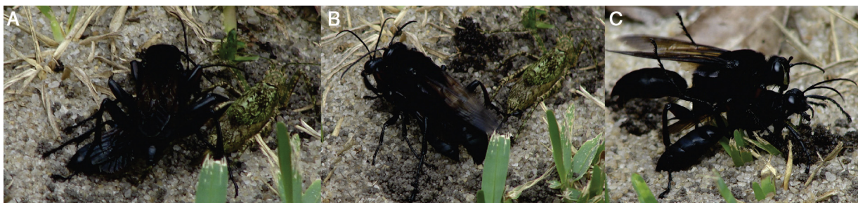
Fig. 2. Sequence of the phase of identification and pre-copulation: (A) immobilization attempts by males while the female is supplying its nest with prey, (B) efficient immobilization of the female and mount in the nesting area, (C) aedeagus extrusion. Female shows a mixed behavior of receptiveness (last pairs of appendages up) and aggressiveness (partially opened mandibles).

The transition of the agonistic behaviors displayed by females during the identification (aggressive display 1: 10.3%, confrontation: 33.3%, and rejection: 33.0%), and copulation phases (aggressive display 2: 24.5%, swaying body movements: 31.1%, drumming: 64.3%, and rejection: 45.9%) indicate a strong trend to