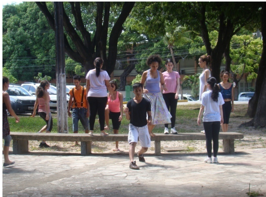
Figure 6 – Students improvising with the cement bank of the UFC's Rectory woods, 2013.

In this trail, we understand that inventing, following Virginia Kastrup (2007), it is not to un-cover solutions already predicted, but to be attentive to the creation of problems different from those already given, being that not always are the humans those who place these problems. Following this path, during the development of the Body/Space course, we felt that we needed to step out from ourselves as generating centers of actions controlled by us and efficiently consummated; step out from the apprehension of the already represented; to activate the memories of/in room 18, so that we would dance with them, making ourselves aware of them; to step out from the classroom to dance with other bodies/spaces; to step out from the understanding of relationships of types already experimented, to search for conditions of choreographing with the things, with spaces/bodies.