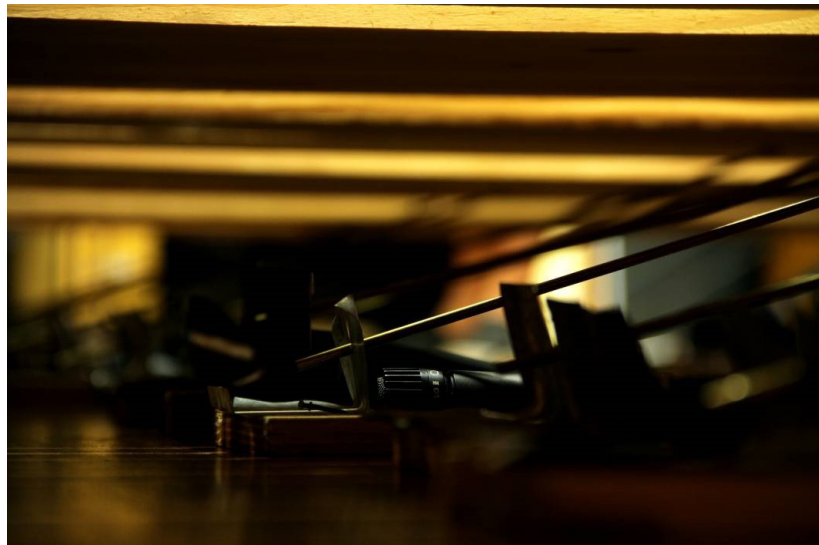
Figure 2 – Microphone sound mechanism (with focus in a bat and iron piece), composing the floor of Verdades Inventadas .