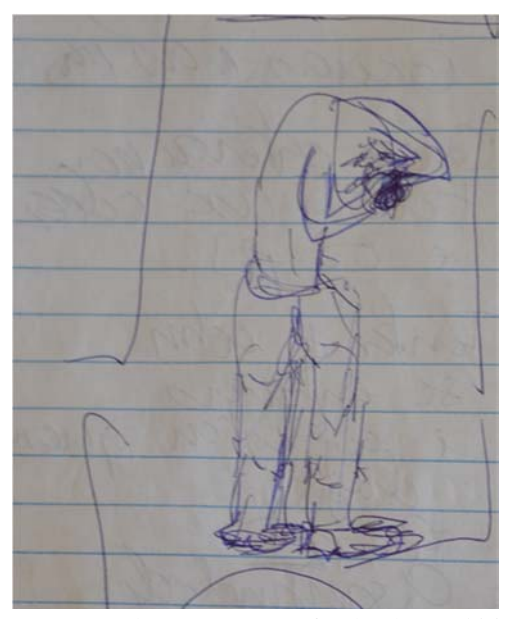
Figure 1 – Body improvisation for the show Aldebaran , 2012.

I experiment torso flexing with hands behind my head, knees bent, looking at my feet. Pause. I release the right arm, the left arm. Pause. I return to the intertwining of the hands behind the head, on the neck. Suddenly, I raise my torso, I look forward. I spin. I return to the initial image, that of the drawing. I unravel. I resume. I slowly unravel... I quickly resume. Unravel. Repetition. Repeat with variations (Ribeiro, 2015).