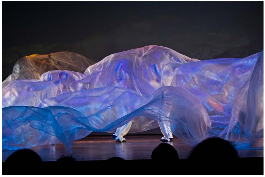
Figure 5 – Image of Aldebaran.

In opposition to the monsters, Aldebaran, guardian of the universe emerges, representing the forces of good against evil. A star of immense brightness, fifty times greater than the sun, its function is to rescue from planet Earth all that was considered sacred and precious and with these assets from humanity rebuild a new world, in some distant point of the universe. Once this task is completed, all that remains of the old planet is the memory of something deeply beautiful that was lost forever (Medeiros, 2013, p. 1).