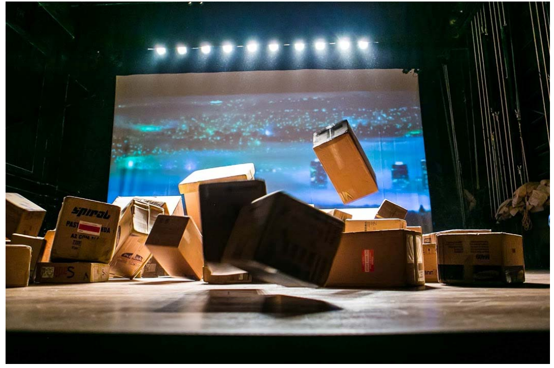
Figure 4 – Image from Aldebaran . Author: photographer Netun Lima, 2013. Source: Group's personal archive.

At the end of the work, the star Aldebaran, possessing a great shine, approximates bringing with it a promise of peace and renewal. In the scene, Aldebaran breaks through to save the planet, rescuing from the Earth that