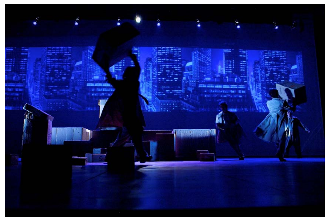
Figure 3 – Image from Aldebaran. Author: photographer Netun Lima, 2013. Source: Group's personal archive.