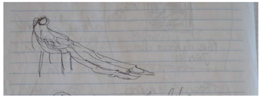
Figure 7 – Body improvisation for the show Aldebaran .

I sit. I gradually slide down the chair. I follow the drawing. The head tilts forwards. I look and see tiredness, a body exhausted from movement. I let be... I only move internally. I think, I feel, think-feel, I imagine. On the outside: silence. The feet I see are asking me for movement. I drag the soles of my feet on the floor alternating between right and left. I accelerate. I run seated. I fall. Acceleration. Interruption (Ribeiro, 2015).