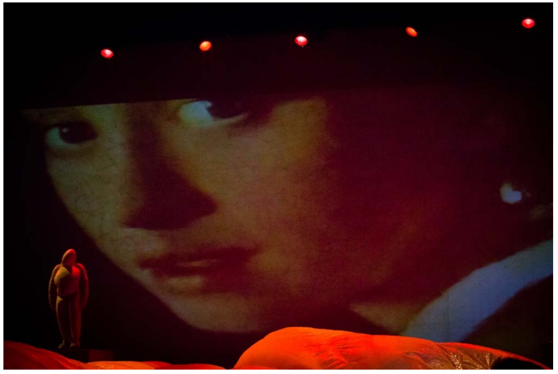
Figure 6 – Image from Aldebaran .

The actors were closely accompanied in their inventive process for scenic movements. Since 1977, the director has kept the habit of registering the whole phase of mounting the show, which includes corporal rhythmic training 16, improvisations and theoretical studies. For Medeiros, writing in process notebooks enhances due to the precision of the details in the registers of that observed. Writing composed of words and drawings has allowed me to think of the body in process. And what marks this body in the creation process of Aldebaran ? What would its singularities be?