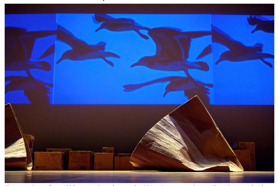
Figure 2 – Image from Aldebaran . Author: photographer Netun Lima, 2013. Source: Group's personal archive.

object which, little by little, expands its movement until it is in a vertical position. The actors who animate the paper are not seen and the scene is constructed, minimalistically, in earthen tones to the sound of birds.