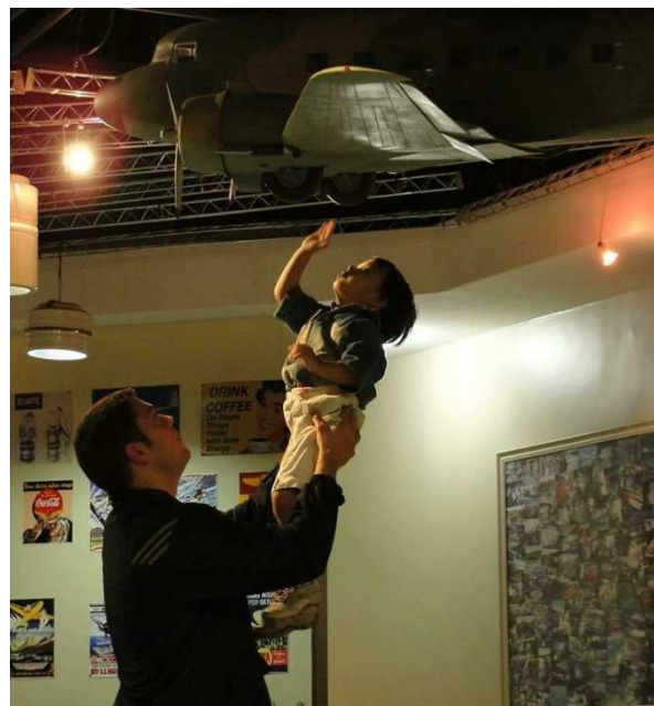
Figure 4 – Connection with the Son. Picture: Shot by Leônidas de Oliveira Neto and used as part of the ritual theater artistic process.

Source: Personal Archive of the Researcher.