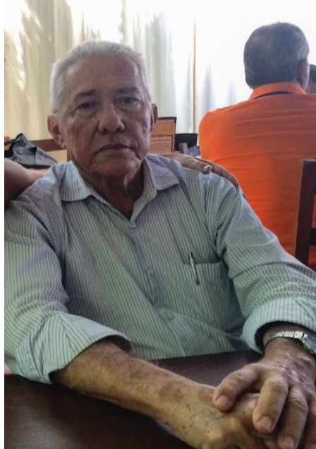
Figure 3 – The Father. Picture: Shot by Leônidas de Oliveira Neto and used as part of the ritual theater artistic process.

Let us see the two images (Figure 3 and Figure 4):