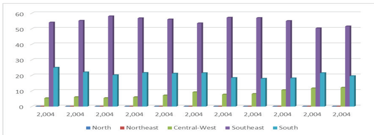
Figure 1: The relative contribution of regional exports to the total of national exports, between 2004 and 2014 (in %).