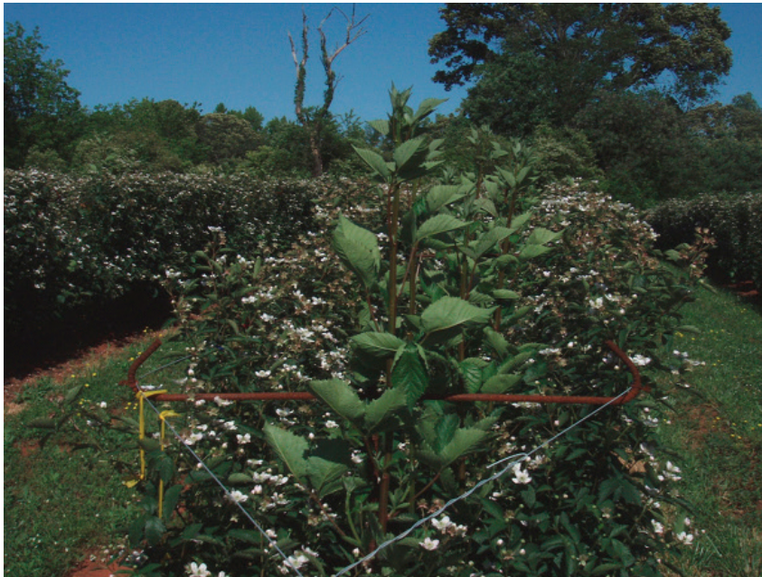
FIGURE 4- Erect primocanes on a mature Ouachita plant at tipping height of about 1.2 m. Floricanes that grew the year prior are blooming with fruit ripe about 50 days after bloom.