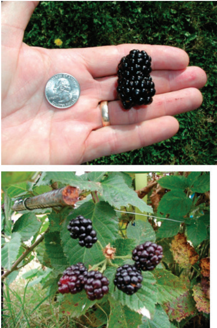
FIGURE 8 -Comparison of fruit of Prime-Jim ® fruit grown in moderate summer and fall temperatures in Oregon (upper photo) and in Arkansas (lower photo). Temperatures during bud, flower and fruit development above 32-35C are detrimental to quality fruit production and areas similar to this are not recommended for primocane-fruiting varieties.