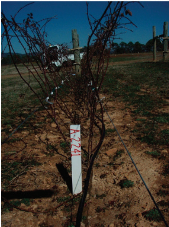
FIGURE 3- First year complete-season growth of Ouachita tied to the trellis for fruiting the next season (upper photo). Natchez canes tied to trellis after one year's growth.