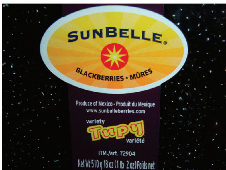
FIGURE 9-Fruit of Prime-Ark 45® (above) in clam-shell packaging for marketing in retail markets in the US. Lower photo is of Tupy blackberries grown in Mexico for US marketing.