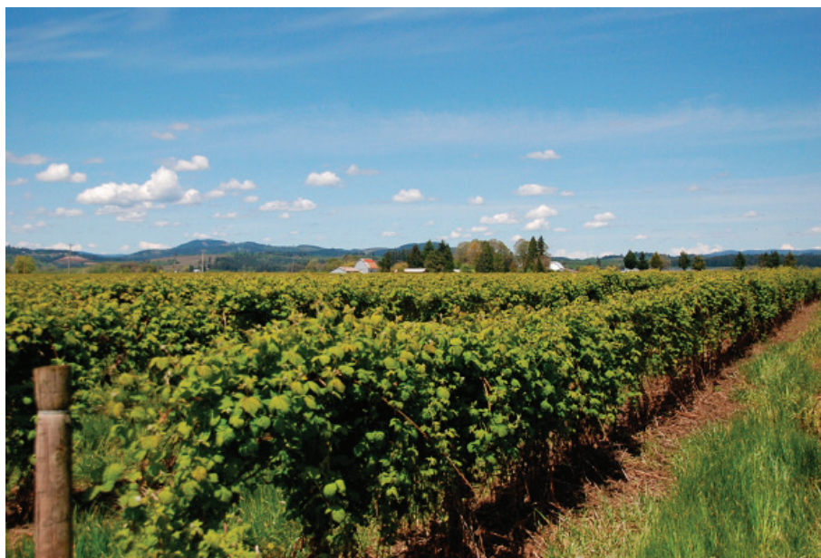
FIGURE 11- Large planting of ‘Marion’ trailing blackberry in Oregon for processing.