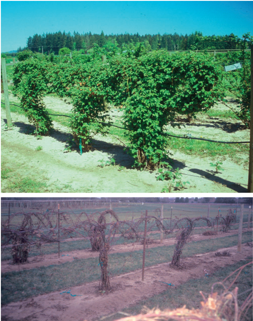
FIGURE 10- Trailing blackberry with leaves (upper photo), and dormant plants tied to the trellis (lower).