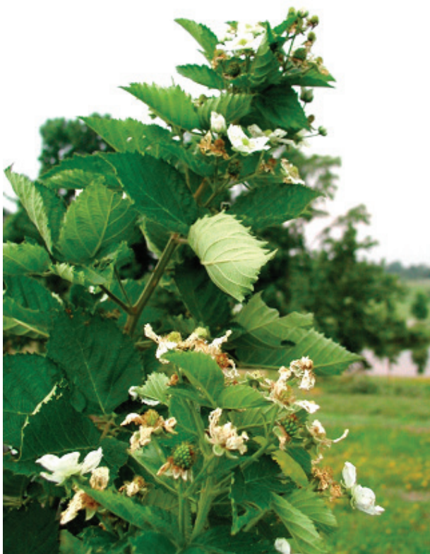
FIGURE 6 -The primocane-fruiting trait expressed on canes, where the canes terminate in a flower rather than remaining vegetative as floricanes-fruiting types grow.