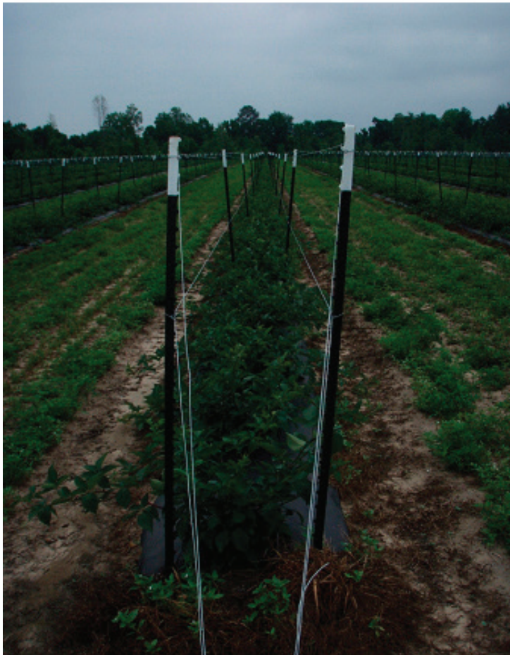
FIGURE 2- Newly established Ouachita erect blackberries on black plastic mulch; upper picture just planted, lower picture after growth has begun.