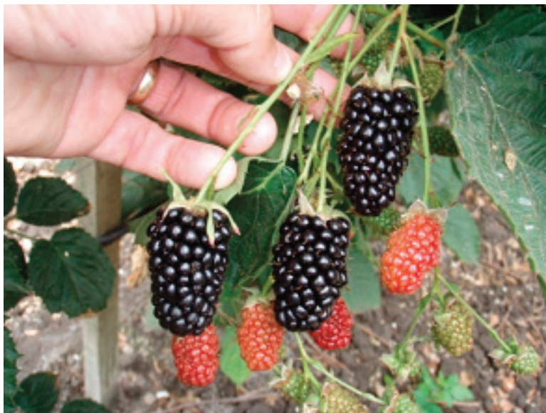
FIGURE 5- Natchez fruit.