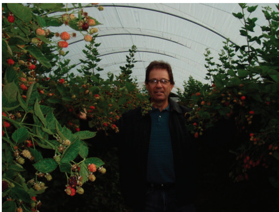
FIGURE 7 - A commercial planting of Prime-Ark 45® in California grown under a high tunnel. Plants begin fruiting in August, this picture taken in mid October.