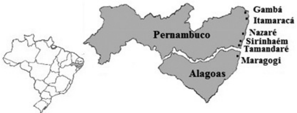
FIGURE 1 – Brazilian map with detail of the states Pernambuco and Alagoas showing the distribution of six sampled populations of Hancornia speciosa var. speciosa Gomes.